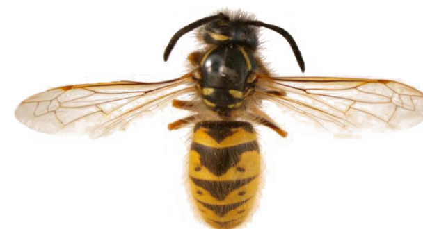
Common Yellow Jacket Vespula vulgaris