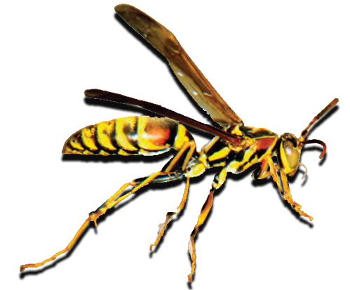
Golden Paper Wasp Polistes fuscatus aurifer