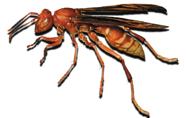
Common Paper Wasp Polistes exclamans