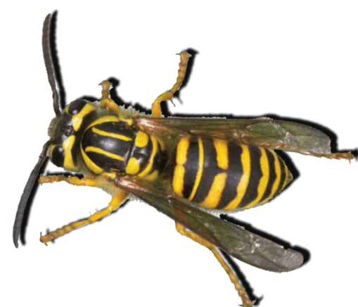
Southern Yellow Jacket Vespula squamosa