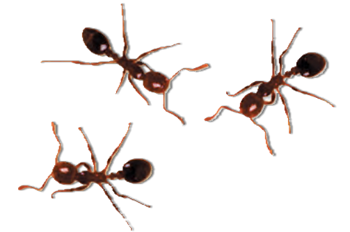
Black Imported Fire Ant Solenopsis richteri