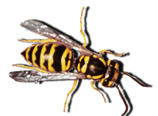
Eastern Yellow Jacket Vespula maculifrons