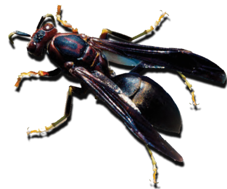
Black Paper Wasp Polistes fuscatus fuscatus