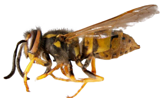
German Yellow Jacket Vespula germanica