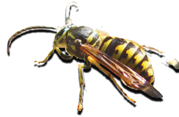
Yellow Hornet or Sand Hill Hornet (Aerial Yellow Jacket) Dolichovespula arenaria