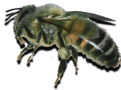
Honey Bee Apis mellifera