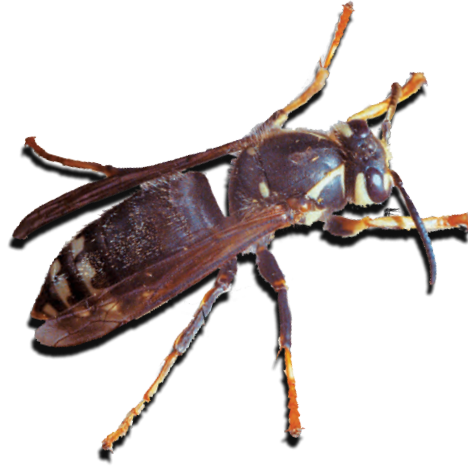
Bald-faced Hornet or White-Faced Hornet Dolichovespula maculata