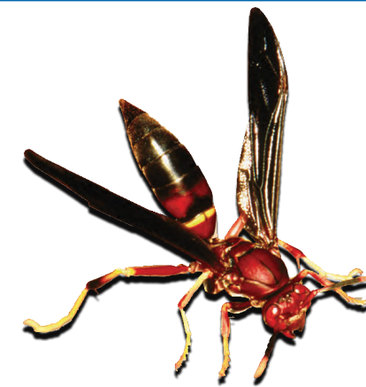
Red Paper Wasp Polistes annularis