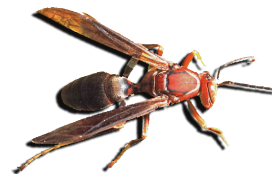
Common Brown Paper Wasp Polistes metricus