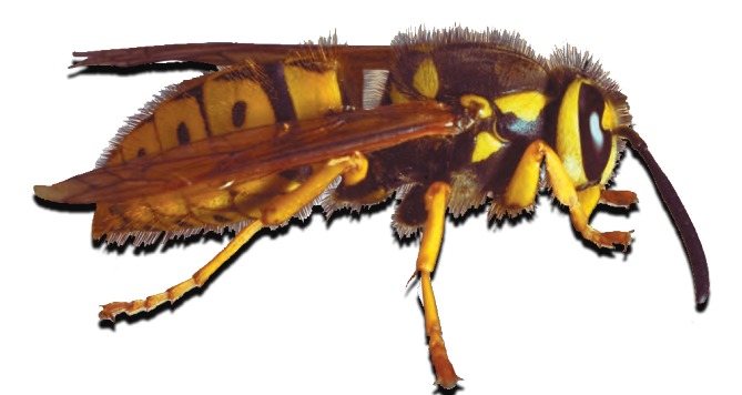
Western Yellow Jacket Vespula pensylvanica